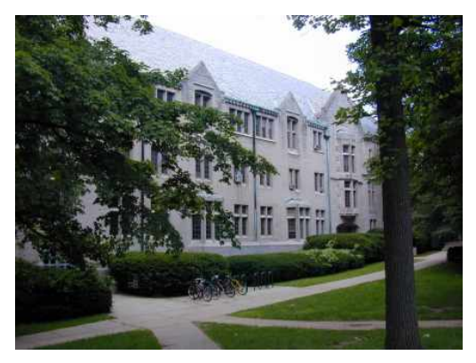
Swain Hall West